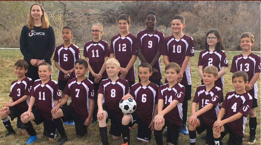
3rd/4th Grade Soccer Team; 2022 Montrose Rec League